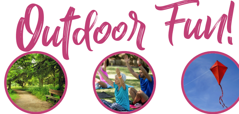
Discover a new trail